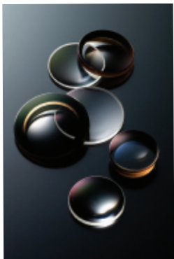
● Danyang Huayun Optical Glass Co., Ltd. 3B-B06