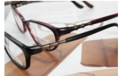
● Wenzhou Lanhai Import & Export Co., Ltd 3B-E16