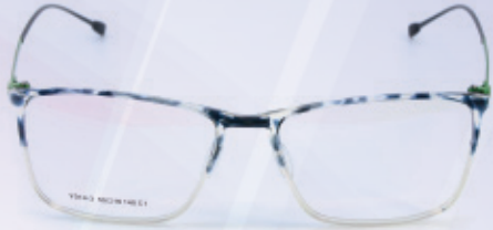
● Shenzhen RunYu Glasses Manufacture Company Limited 3B-E22