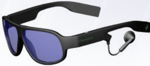
● Shenzhen Yizhixiu Technology Co., Ltd. 3B-D19